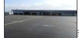
Emergency Evacuation Area