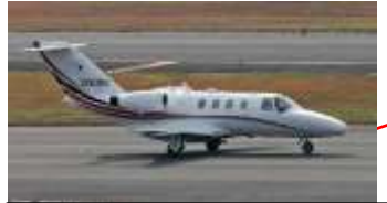
№ 15 Cessna Citation-like (mid-sized)

• Spot 6 is for large business jet parking. ※Apron A is now available for continuous parking.