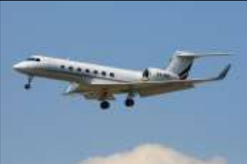
№6 Gulfstream-like (Large)