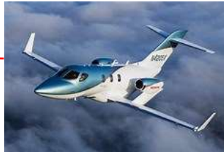
№ 11, 12 Honda Jet-like (small sized)

• Spot 6 is for large business jet parking. ※Apron A is now available for continuous parking.